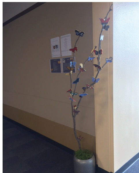
Students created ceramic butterflies in commemoration of Yom HaShoah, based on "I Never Saw Another Butterfly."