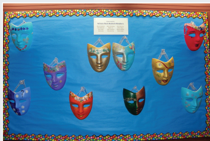
The masks created by the Achava Rosh Hodesh group